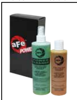
Pro-GUARD 7 Restore Kit