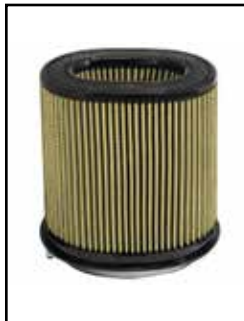
PRO GUARD 7